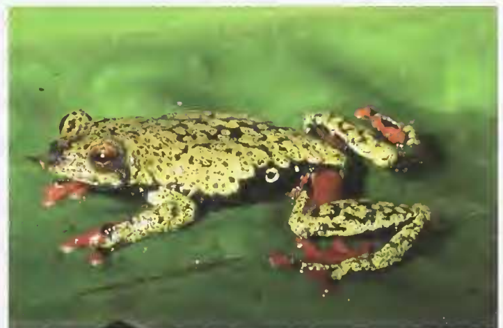
Fig. 2. Lateral view of female paratype (in PhF) of Hyperolius dintelmanni sp. nov. (ZFMK 67890).